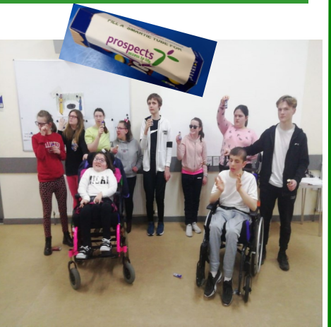
Above - Friendship Club and Following Jesus groups, as well as others at St Columba's church at Kirkintilloch, raised the amazing amount of £470.84 for PAS by filling smartie tubes with money.