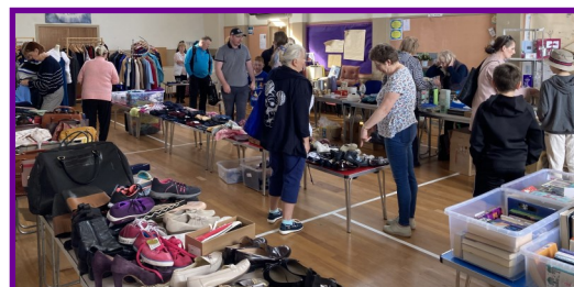
Charity Pop-Up-Shop at Brightons Parish Church