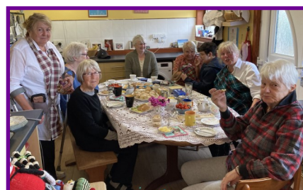
Fun at Conon Bridge Tartan Tea event